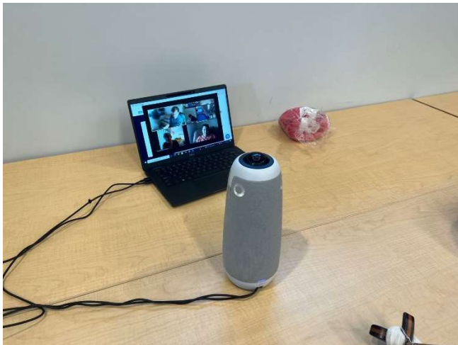
3 rd Thursday Spinning Study Group – Palisades Library Meeting Owl

Now, we just need a way to be able to share the luscious feel of the wonderful fibers that the in-person members bring to the meeting.